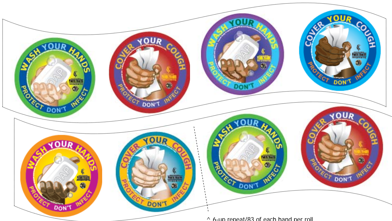
^ 6-up repeat/83 of each hand per roll

We will not be able to fulfill your order if we cannot read it.